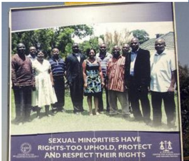
Billboard in Malawi promoting sexual minority acceptance (Chinele, 2017)

"Malawi says it will no longer enforce anti-homosexuality laws but dangerous homophobia persists on the country's streets - and in its clinics" (Chinele, 2017)